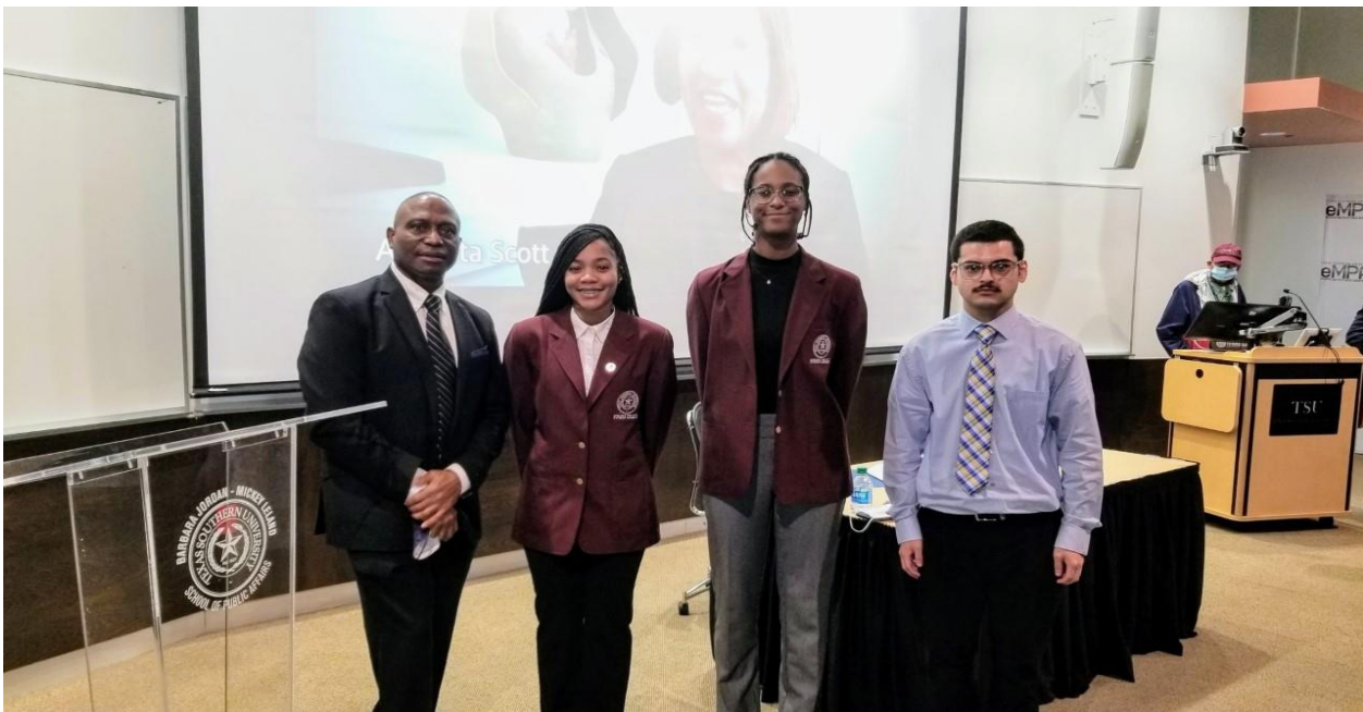
Celebrating the life and legacy of late Congressman Mickey Leland, December 4, 2021.