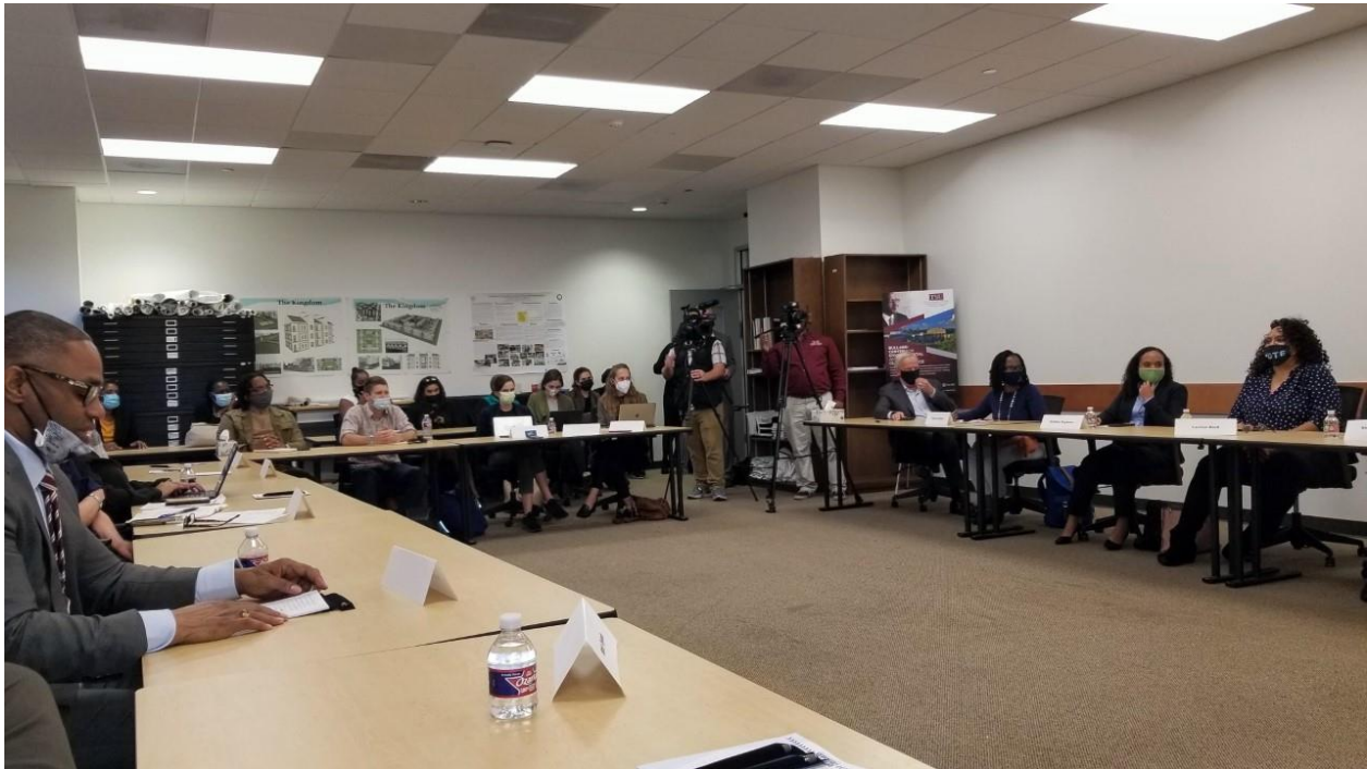
UPEP students with the EPA Administrator, November 18, 2021.