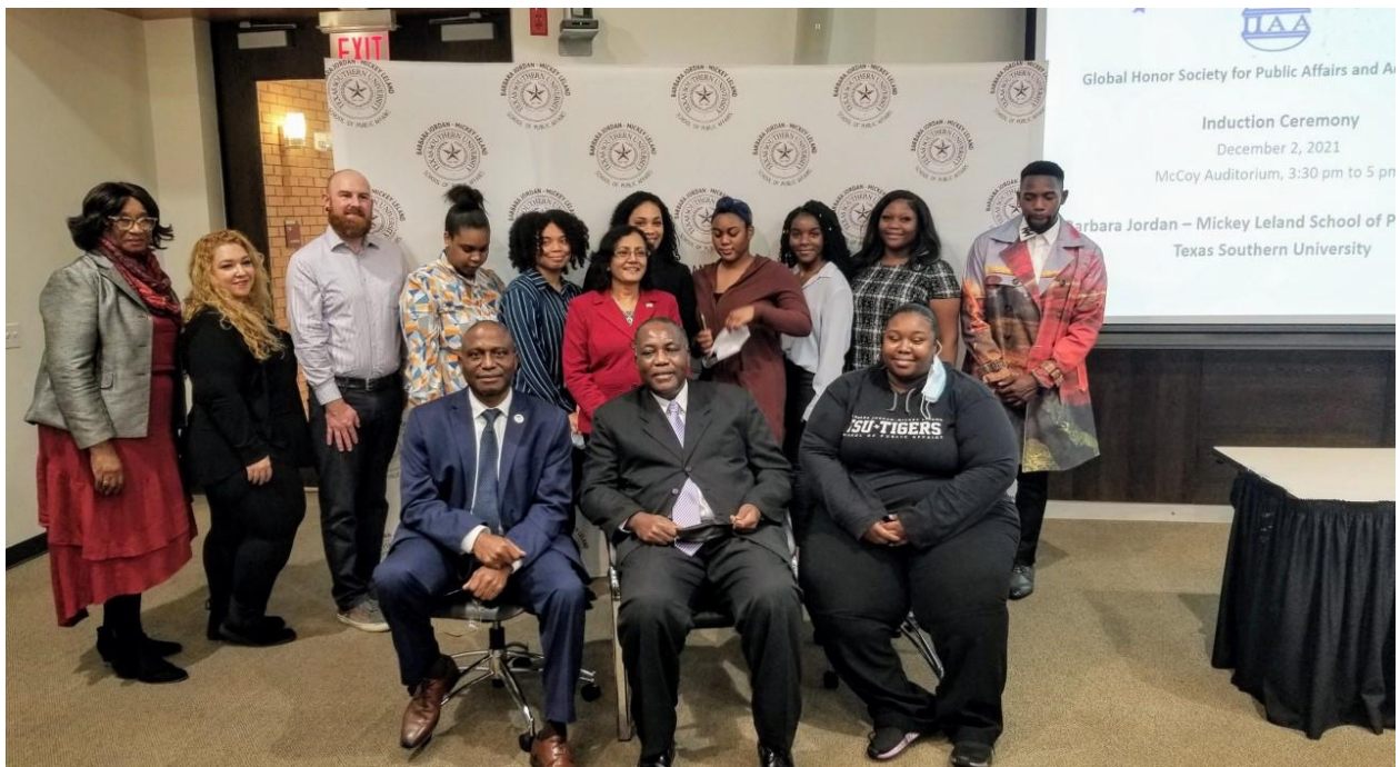
At the induction ceremony of Pi Sigma Alpha and Pi Alpha Alpha Honor Societies, December 2, 2021.