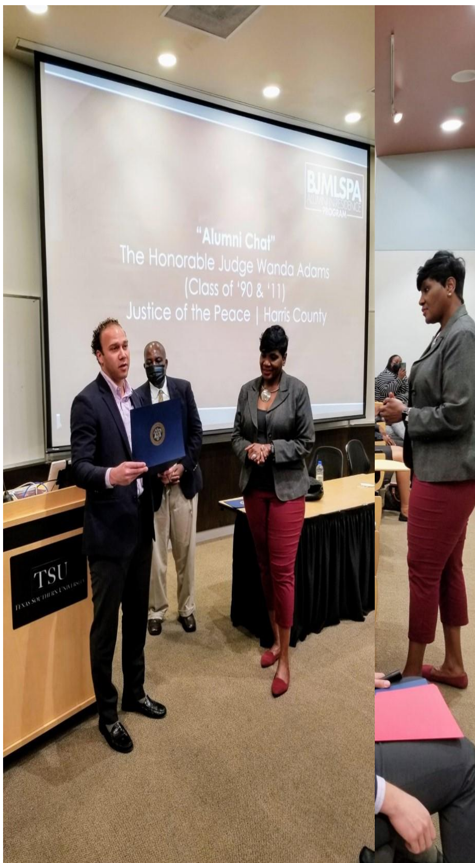
With the Honorable Judge Wanda Adams, November 2, 2021.