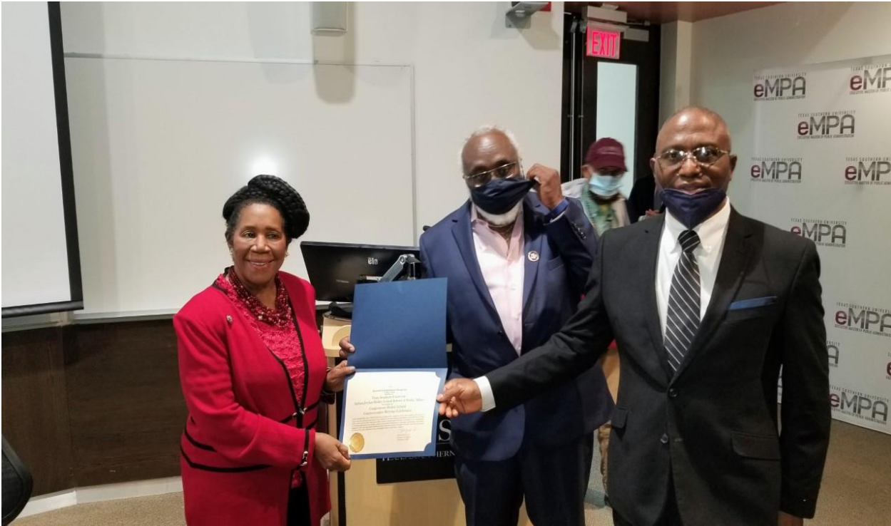
With Congresswoman Sheila Jackson Lee at the SOPA event celebrating the life and legacy of late Congressman Mickey Leland on December 4, 2021.