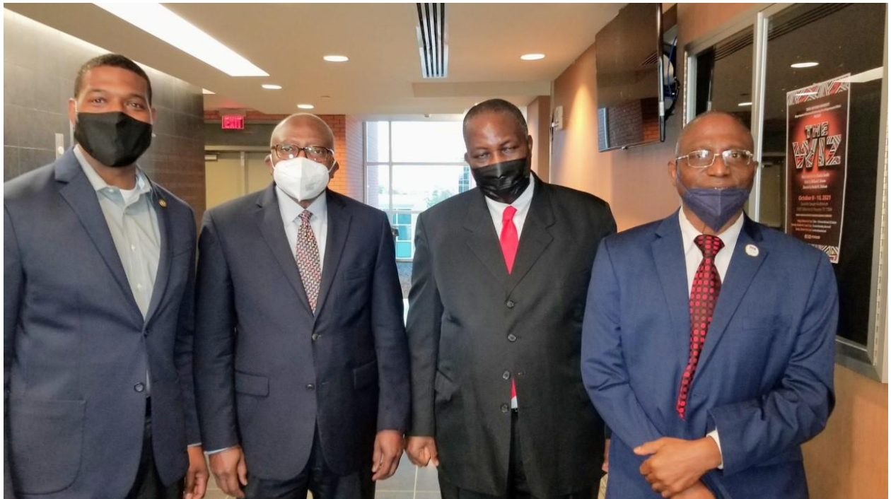
With Michael Regan, EPA Administrator (U.S Environmental Protection Agency) November 18, 2021.