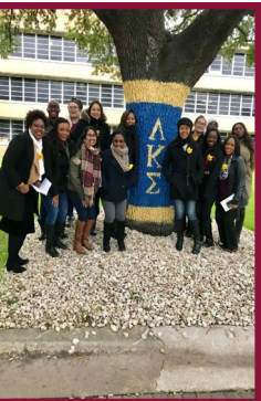
Lambda Kappa Sigma New Member Intake

APhA-ASP participated in the "Brown Bag" event to assist and counsel the medications the elderly were taking to ensure that they got the most out of their medication.