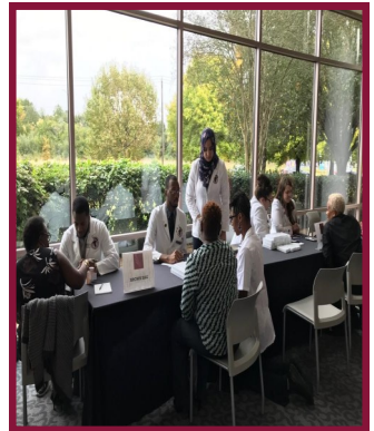
APhA-ASP at the "Brown Bag" event

Lambda Kappa Sigma welcomed eleven new members on November 14th, 2018. They also completed two community service projects for the month of November. Their first community service project consisted of building basic hygiene kits for a local charity, The Star of Hope- Women and Family Emergency Shelter. The second community service project they partnered with the Office of Veteran Affairs located on campus. The Office of Veterans Affairs held an event called "A Million Thanks", in which they wrote thank you cards that will be sent to the US troops for the holiday season.