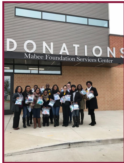
Lambda Kappa Sigma at The Star of Hope-Women and Family Emergency Shelter